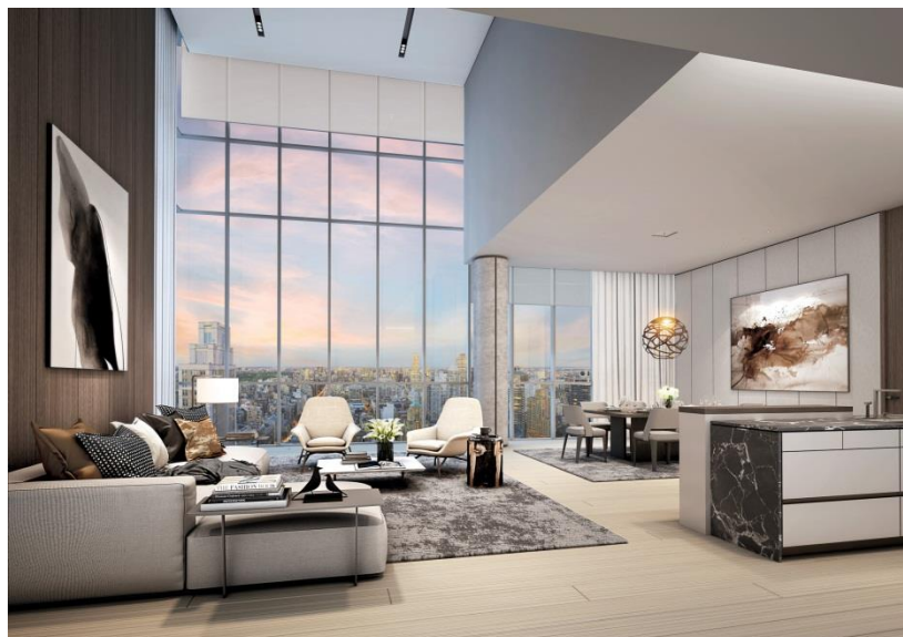
Great room, image by Williams New York

The envelope will feature floors stacked in boxes of four, set at off-angles. The new renderings give a close-up of the glass cladding, which will evidently feature on both the northern and southern sides of the tower. The lot-line walls are slightly more mundane.