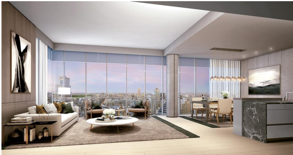
Simplex great room