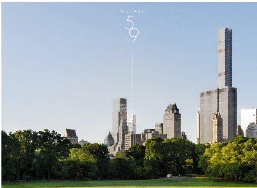
118 East 59 th Street

YIMBY first reported on permits for 118 East 59th Street back in September of 2014 , and we posted the first renderings back in January . Now we have the full set of images depicting both exteriors and interiors for the project, and its website has also gone live .