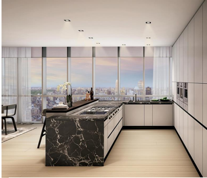
Kitchen