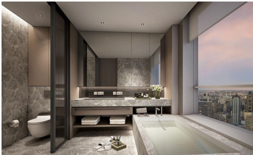
Bathroom, image by Williams New York

Still, views from inside will be relatively impressive. Demolition of the site's old buildings is now complete and the new tower is expected to open by 2018.